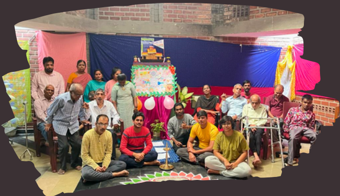
Friday Fun Filled with Birthday Joy!