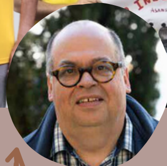
Chair of the International Stewardship Board